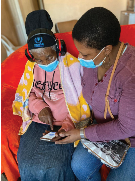
Figure 2: Community member having her hearing tested via in-situ audiometry

placed over the hearing aids (creates an environment comparable to a single-walled sound booth) was conducted to obtain an individual's audiogram. Smartphone AI video-otoscopy via the hearScope (hearX group, Pretoria, South Africa) was conducted to evaluate patency of the ear canal to accommodate a hearing aid and identify ear disease (wax obstruction or possible middle-ear infection). Relevant referrals to clinics or ENTs were made if any abnormalities were detected. Lastly, the risk profile for potential asymmetric or conductive losses was determined through an algorithm using digits-in-noise (DIN) test results in combination with air conduction pure tone audiometry thresholds 7 . This recently validated technique has a reported 94% accuracy to differentiate sensorineural hearing loss from conductive or asymmetric hearing loss requiring medical follow-up. This approach negates the need for bone conduction testing in community-based settings by triaging patients