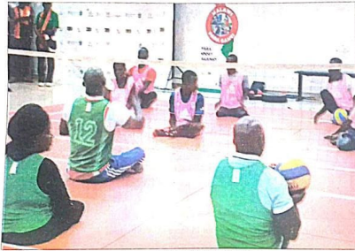
A sitting volleyball game underway at Bingu National Stadium