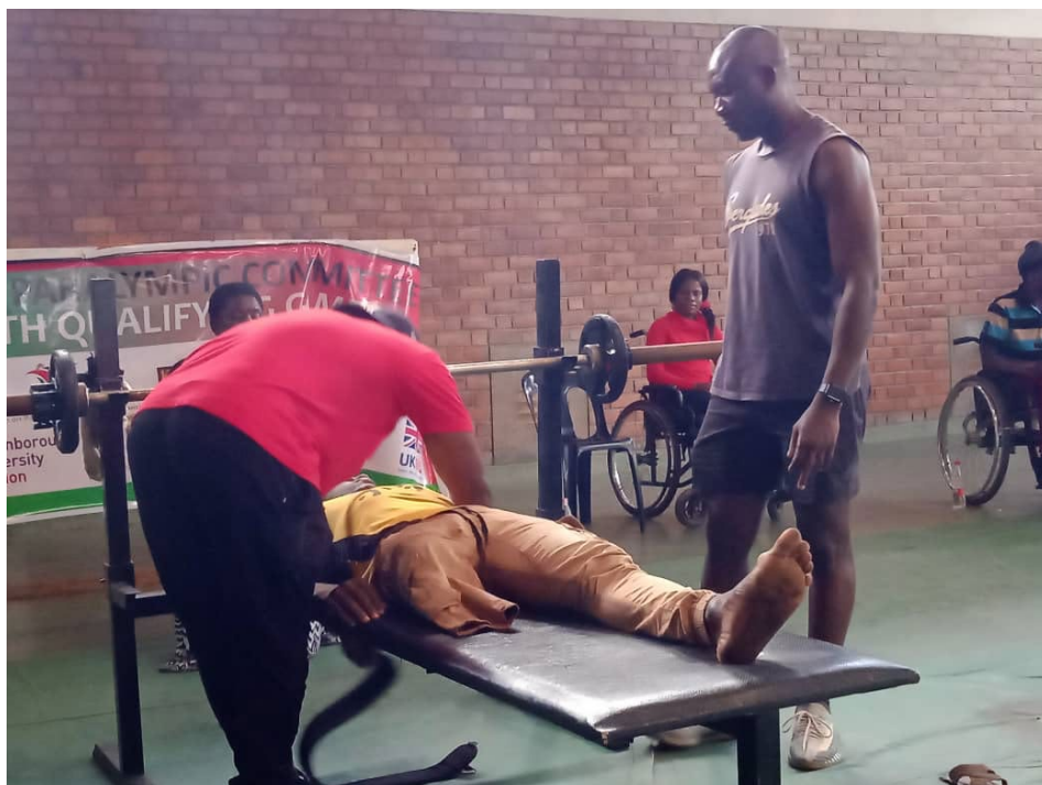
Malawi: Athlete training camp activities