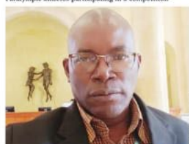
Chitsui: We want to have a strong national team

athletics. We want to have a strong national team and many options in relation to classification," he said.