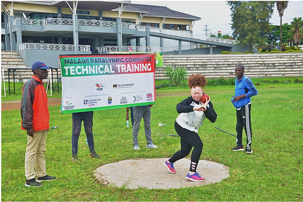
Malawi Para Games 28 December 2023