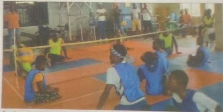
Paralympics sitting volleyball game at Kamuzu Institute for sports