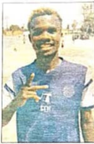
UNDER DISPUTED TRANSFER—Mwalilino

shine on the national stage," he was quoted as saying.