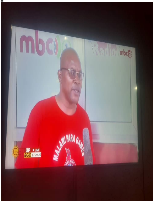
Malawi Paralympic Committee President live on Malawi Broadcasting Corporation explaining the 2 nd edition of the Malawi Para Games