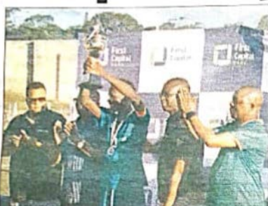
DECORATED—Chicago captain receives the trophy