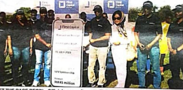
LET THE RACE BEGIN—Officials pose after unveiling sponsorship