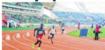
Paralympic athletes participating in a competition

"We want to be represented in powerlifting, sitting volleyball, wheelchair basketball and also