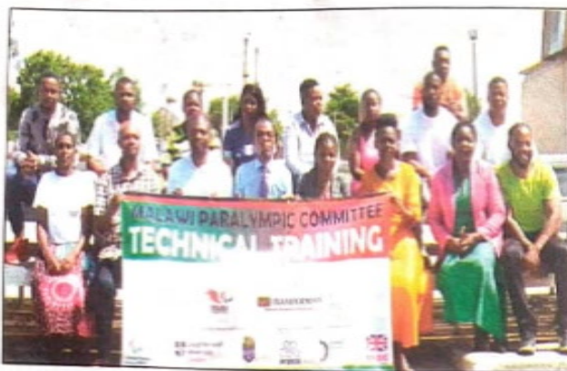
EQUIPPED WITH KNOWLEDGE—Participants

He said the training session served as a platform for MPC to empower coaches with the