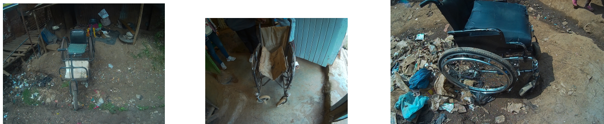
Figure 1: Examples of wheelchairs used by participants in the study from the left (P1, P6 and P8)