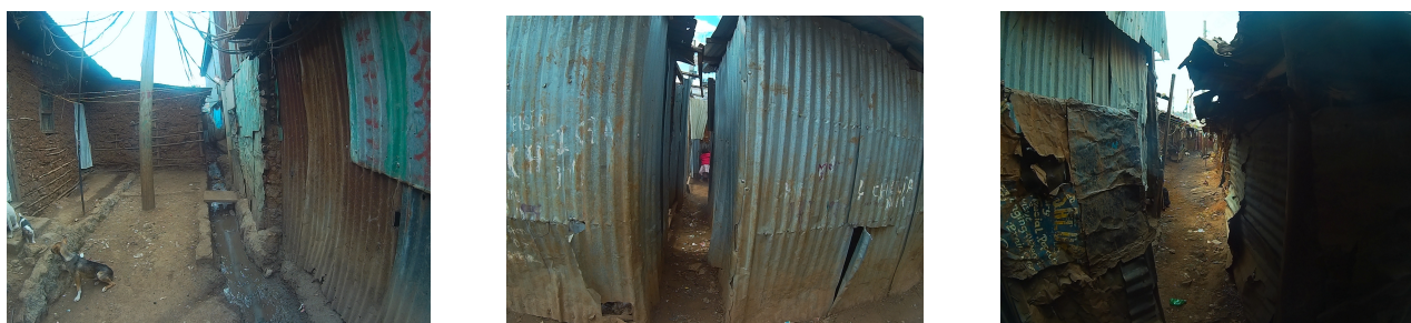
Figure 2: Three examples of side streets commonly found in different parts of Kibera

thing because if I go without it is very tiring so I just sit and go”