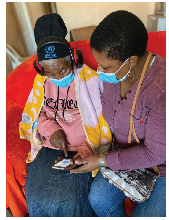
Figure 2: Community member having her hearing tested via in-situ audiometry

placed over the hearing aids (creates an environment comparable to a singlewalled sound booth) was conducted to obtain an individuals' audiogram. Smartphone AI video-otoscopy via the hearScope (hearX group, Pretoria, South Africa) was conducted to evaluate patency of the ear canal to accommodate a hearing aid and identify ear disease (wax obstruction or possible middle-ear infection). Relevant referrals to clinics or ENTs were made if any abnormalities were detected. Lastly, the risk profile for potential asymmetric or conductive losses was determined through an algorithm using digits-in-noise (DIN) test results in combination with air conduction pure tone audiometry thresholds<sup>7</sup>. This recently validated technique has a reported 94% accuracy to differentiate sensorineural hearing loss from conductive or asymmetric hearing loss requiring medical followup. This approach negates the need for bone conduction testing in communitybased settings by triaging patients