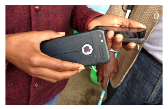
Figure 4: An example dependent interaction – an M-Pesa agent helps a participant perform financial transactions by entering relevant data on the phone.

In the co-design exercises participants were asked to describe future scenarios in which technology enabled a visually impaired child who would live their life in Kibera to interact with the world in whichever way they wanted.