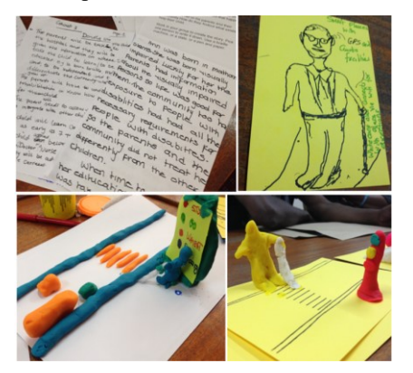
Figure 3: Stories and technology solutions developed by participants during the co-design workshop. From top left clockwise: Stories from the future, GPS-enabled talking white cane and two Barra Barras (Zebra crossings).

In people's vision of the future, VIP children were not restricted when interacting in society. This unrestricted access was possible due to social acceptance. In these new realities "stigmatization is limited" and VIPs are "high profile" [G4]. Therefore, there were no restricted interactions. Instead a new category – unrestricted interactions – emerged. Unrestricted interactions are characterized by external factors to the specific interactions with the technology. These external factors are in essence all part of social acceptance.