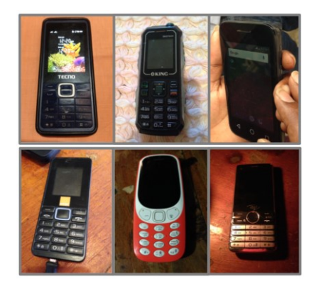
Figure 1: Mobile phones used by interviewed participants

Table 1. Demographic characteristics and type of mobile phone owned by participants taking part in semi structured interviews and ethnographic observations